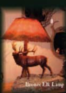
Bronze Elk Lamp