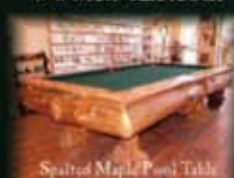
Spalted Maple Pool Table